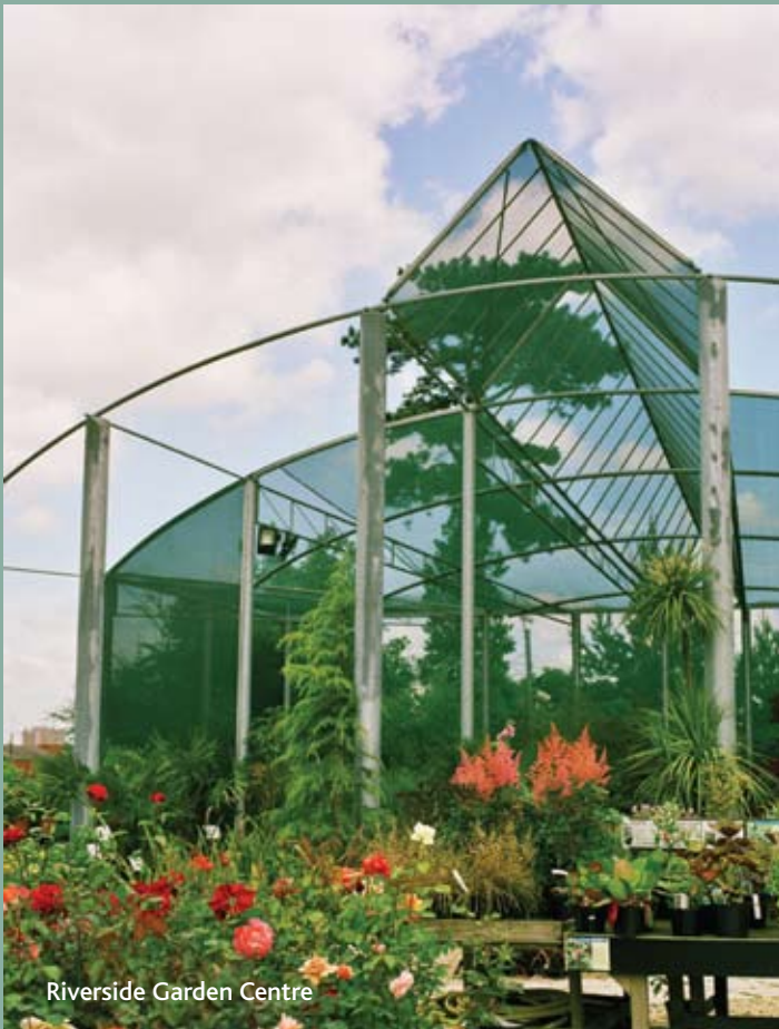
Riverside Garden Centre