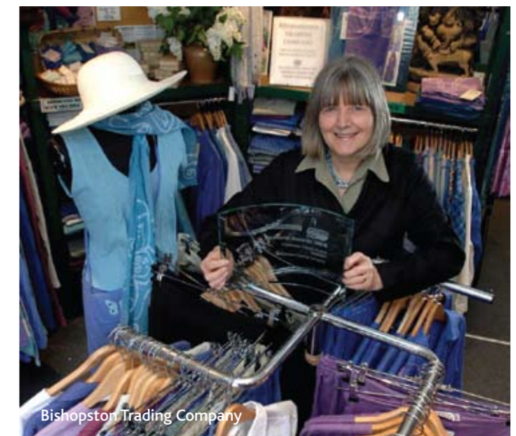
Bishopston Trading Company