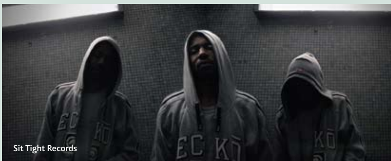
Sit Tight Records

‘ Sit Tight Records would not have become a workers co-operative without the help of the CDA. Becoming a workers co-operative suited the model of business we already aspired to be. It gave us a structure and legitimacy that wasn't there before. ’