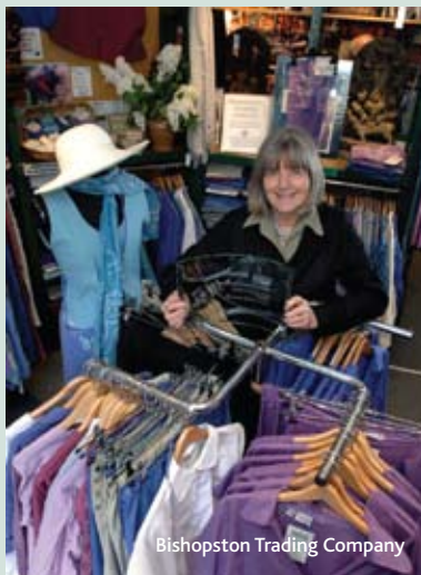
Bishopston Trading Company

‘ CDA (BRAVE Ltd) have steered us through critical points in our development and provided a stable point of reference. ’