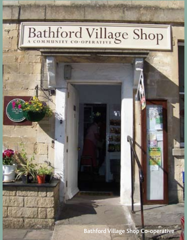
Bathford Village Shop Co-operative