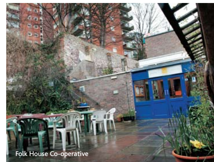
Folk House Co-operative